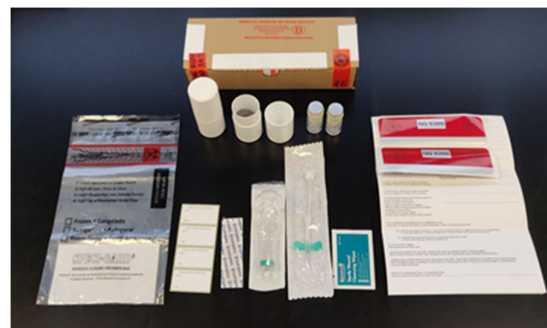
Kit with Safety-Multifly needle

Use the needle and syringe provided to obtain a blood specimen, withdraw all the blood from the needle and tubing (if using the Safety-Multifly needle) into the syringe. Detach the needle from the syringe and dispose of the needle safely. Divide approximately equal volumes of the specimen into each of the specimen bottles provided, see note (a). Close the bottles firmly by the screw caps and mix by repeated inversion. This will ensure that the anticoagulant and preservative in the bottle will mix thoroughly with the specimens.